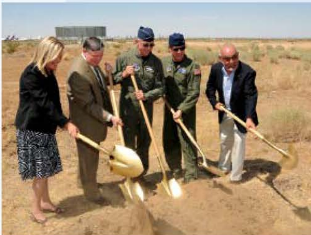
The Air National Guard breaks ground on a new hangar at SCLA in Victorville.

In August 2010, The Air National Guard broke ground on a new hangar at Southern California Logistics Airport (SCLA). The multi-million dollar facility is the first ever Air National Guard hangar to be built specifically for Remotely Piloted Aircrafts (RPA). The California Air National Guard has been operating out of a temporary facility at SCLA conducting launches and recovery operations on the MQ-1 Predator. The Predator has been used extensively in Afghanistan and in other military actions overseas. Once complete, the new hangar will provide a custom space for the Predator and other RPAs.