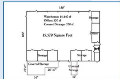
Bldg 789 Floor Plan