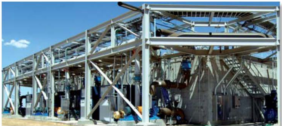
Victorville's New Industrial Wastewater Treatment Facility at Southern California Logistics Airport.

The new industrial wastewater treatment facility is owned and operated by the City and has been designed with an overall capacity of 2.5 million gallons per day. It includes anaerobic and aerobic wastewater treatment utilizing membrane bioreactor (MBR) technology and UV disinfection. The facility is ideal for food and beverage manufacturing operations and other manufacturing uses requiring high wastewater discharge. It also provides reclaimed water for a number of uses including landscape irrigation, golf course irrigation and for cooling towers at the High Desert Power Project at SCLA.