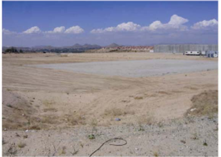
Foxborough Industrial Park's 5 - Acre Development Site