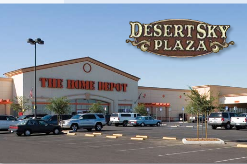
Desert Sky Plaza in Victorville, CA.

Both centers are conveniently located near Interstate-15 with high visibility from the Roy Rogers Drive interchange. The developments will service the growing Civic Center of Victorville that includes existing offices, several new office buildings currently under construction and government offices. With the development of these new retail centers, Victorville will be able to service the ever-growing population in and around Civic Center, and the entire Victor Valley.