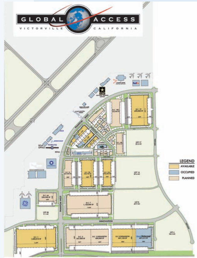
SCLA's master plan includes over 2 million square feet of available industrial space.

The City of Victorville and Stirling Enterprises continues development at SCLA with several buildings recently completed as a part of Phase 1 development. Over 2 million square feet of industrial space is currently available with over four million square feet in the planning stages.