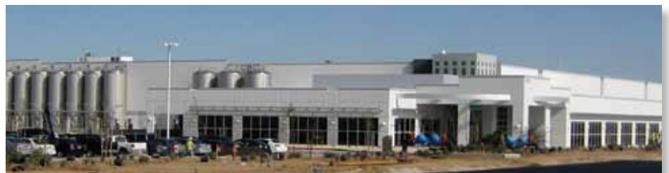
Dr Pepper Snapple facility