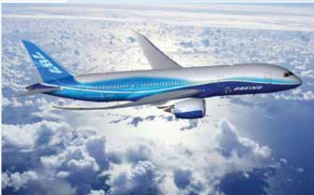
Boeing's new 787 Dreamliner currently being tested at SCLA.

Beginning in March 2010, Boeing, Co. began testing its new 787 Dreamliner aircraft at Southern California Logistics Airport. The aggressive flight-testing schedule includes six planes flying a total of 90 hours per week at the peak of testing. Boeing will have to produce the new 787 Dreamliner faster than any other large airplane they have previously designed to meet their goal of producing 120 new 787s a year by 2013. Right now Boeing is producing two planes per month, hoping to increase its output to 2 ½ in August. The company maintains a rigorous testing schedule that includes 12-hour shifts so operations can continue around the clock. Boeing has a total of 300 personnel stationed at Victorville for the duration of the testing.