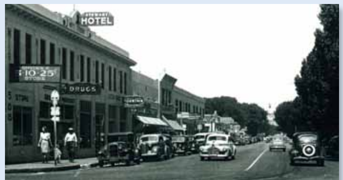
Route 66 in Old Town Victorville, along present day D street.